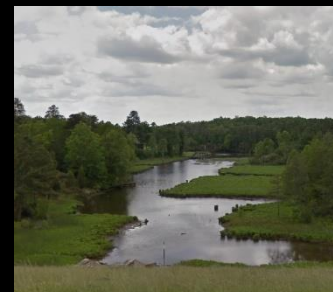
STOP 4 - James City County