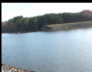
STOP 3 - New Kent County