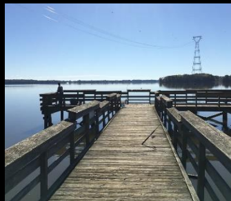
STOP 2 - Charles City County