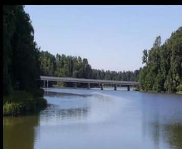
STOP 1 - Williamsburg

A fun 75+ mile ride through York, JCC, Charles City, and New Kent Counties country roads.